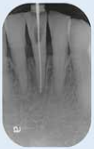
Endo - Size 0 PSP