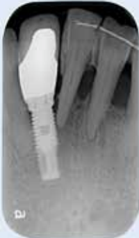
Implant - Size 1 PSP