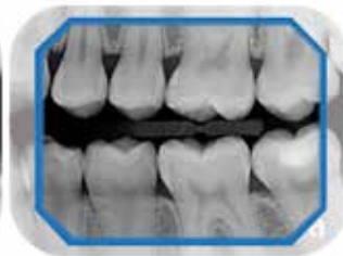
Common Sensor Size 2