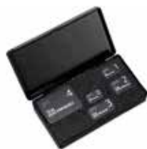
Plate Transfer Box

Size 0, PN 73566-0, Qty. 1 Size 1, PN 73566-1, Qty. 1 Size 2, PN 73566-2, Qty. 1 Size 3, PN 73566-3, Qty. 1 Size 4, PN 73566-4, Qty. 1