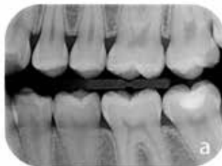
ScanX PSP Size 2