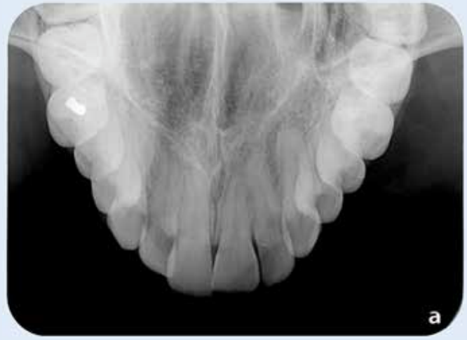
Occlusal - Size 4 PSP