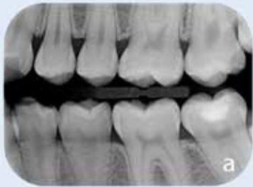
Bitewing - Size 2 PSP