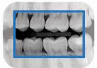
Common Sensor Size 1

The level of detail and clarity achieved by ScanX PSPs is superior to that of X-Ray film and other PSP systems. Your images will enable you to make reliable and sound treatment diagnoses.